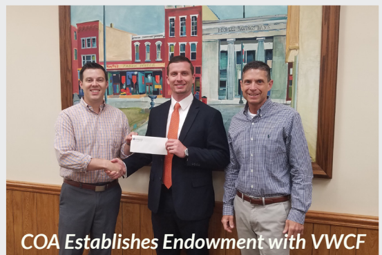
COA Establishes Endowment with VWCF