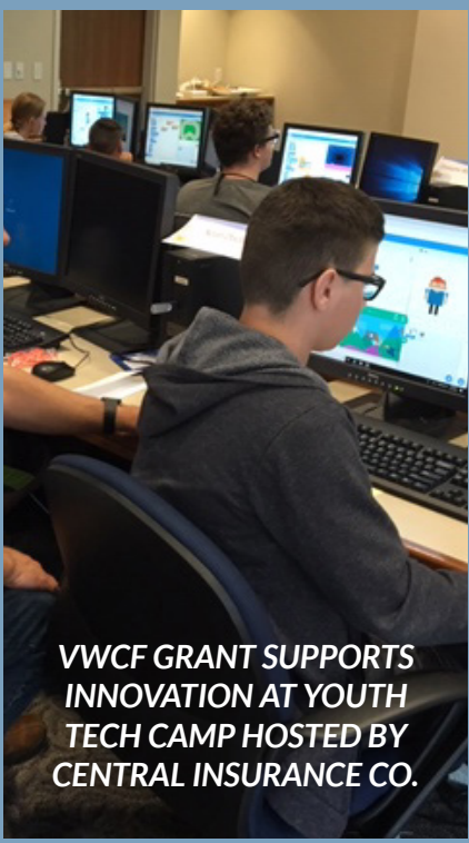
VWCF GRANT SUPPORTS INNOVATION AT YOUTH TECH CAMP HOSTED BY CENTRAL INSURANCE CO.

Groups mixed of trustees and staff tackled these areas to establish goals, strategies, and work plans. We look forward to transitioning from a transactional cohort to a transformational partner as we strive to improve the quality of life in Van Wert County.