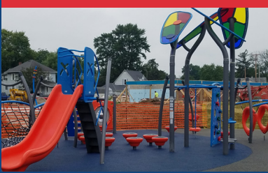
PLAYGROUNDS READY FOR FUN