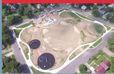
AERIAL VIEW OF CONSTRUCTION