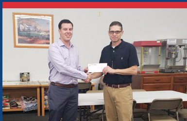
SUPPORTING PURPOSE 2017 Grants Awarded