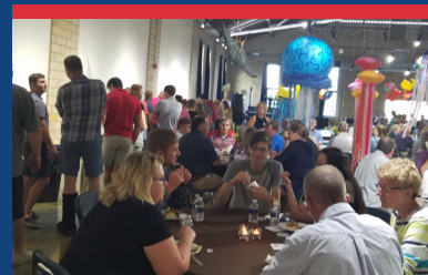
BUILDING THE FUTURE 2017 Scholarship Celebration