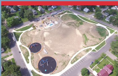
INSPIRING GROWTH Franklin Park project