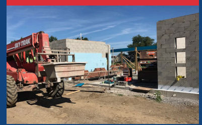
BUILDING THE PAVILION

After a couple of years of planning and design work, much progress has been made this summer on the Franklin Park project.