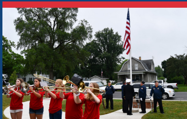
FLAG RAISING CEREMONY